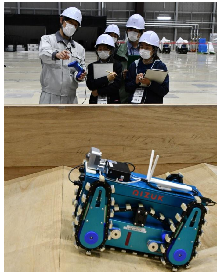
▲ Children operated robots at the Naraha Center for Remote Control Technology Development of the Japan Atomic Energy Agency (JAEA). They learned firsthand about the difficulties of decommissioning and the staff's commitment.