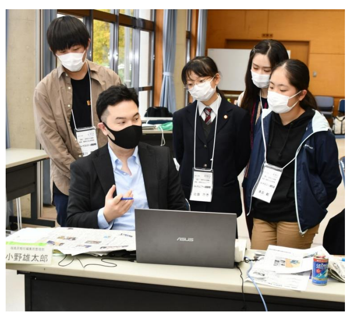
▲ Children getting layout advice from an experienced journalist. They worked on the layout, thinking about how to make it easier to read.